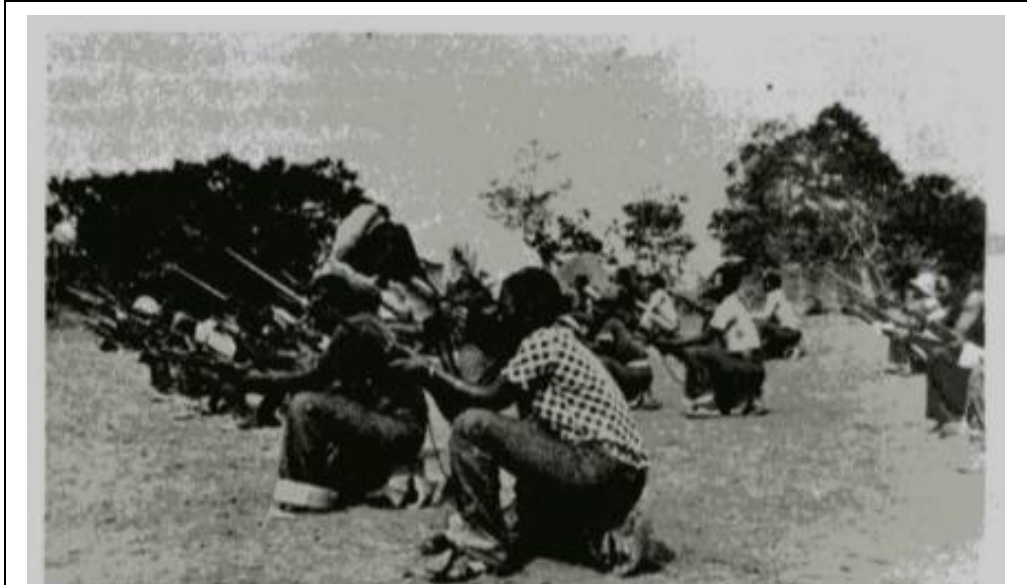
Above all, the learning to shoot straight is one of ZANLA's most important rules of economics