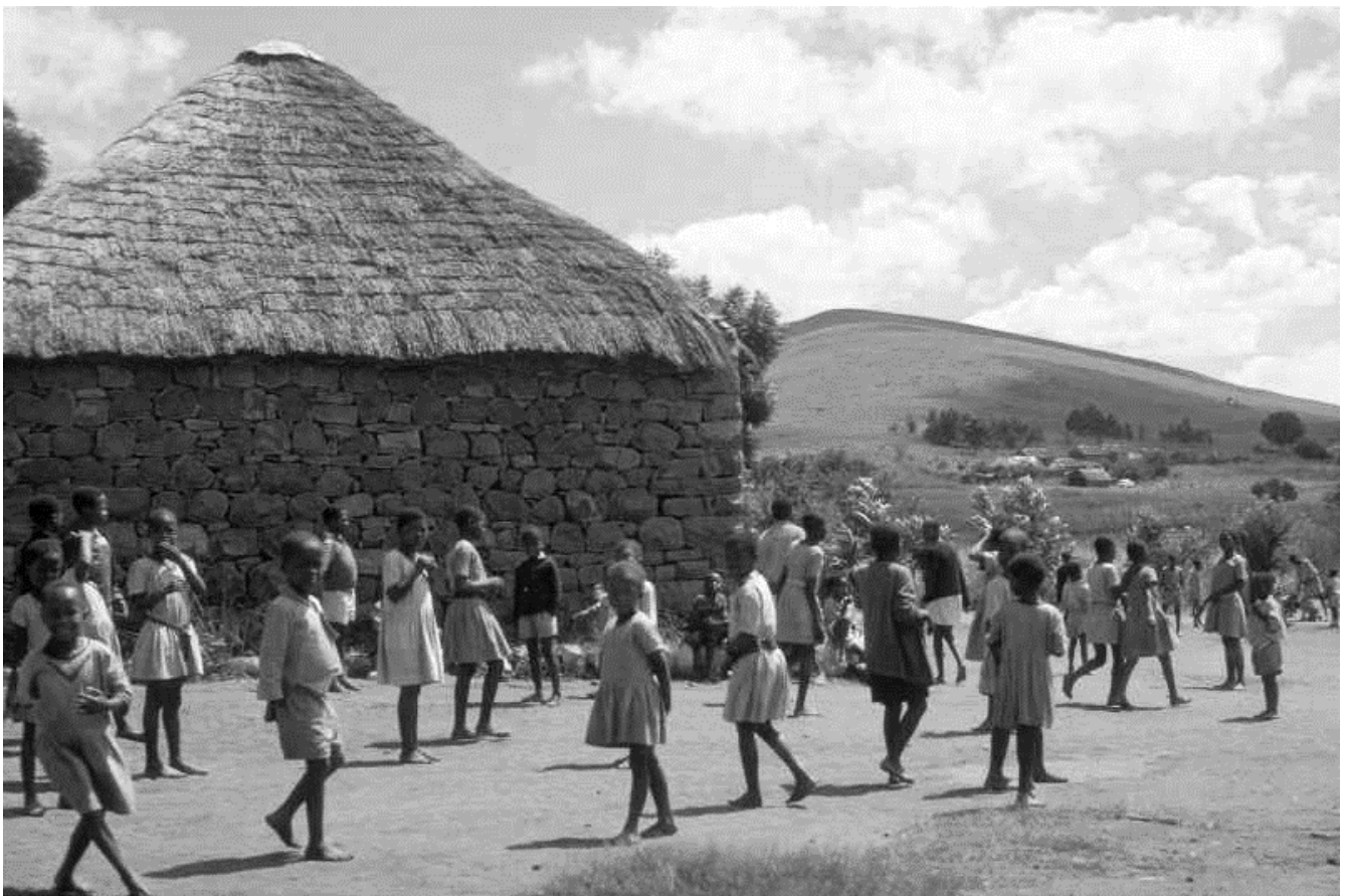
Magubheleni Primary School, 1970.