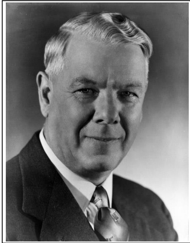
A portrait of Hendrik Verwoerd.

Study the portrait below and answer the questions that follow.