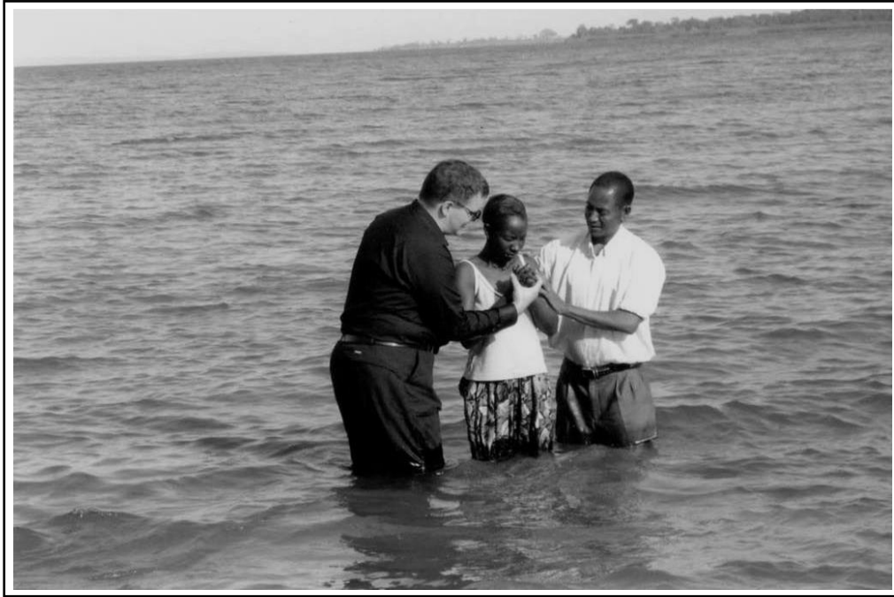
A Christian being baptized.

Study the portrait below and answer the questions that follow.