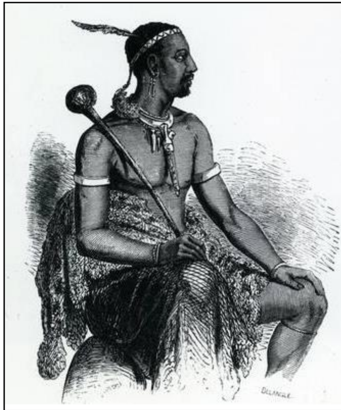
A portrait of Moshoeshoe I.

Study the portrait below and answer the questions that follow.