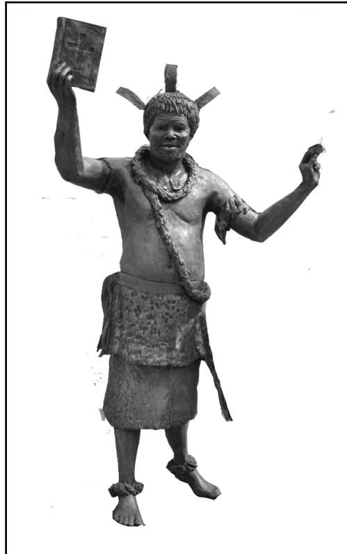
The portrait of Sobhuza I.

Study the portrait below and answer the questions which follow.