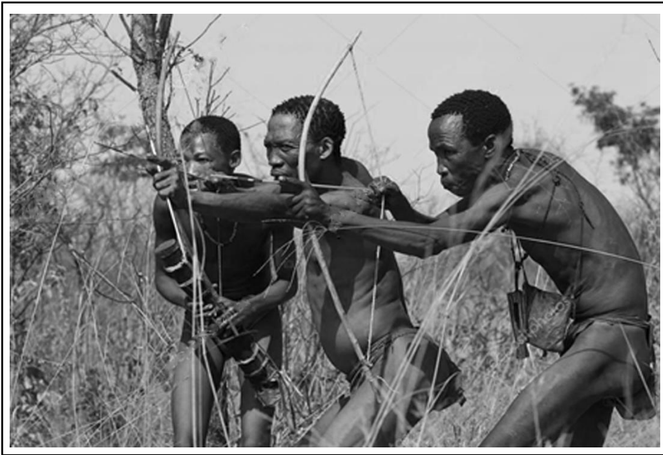
Picture of the KhoiKhoi.

Study the picture below and answer the questions which follow.